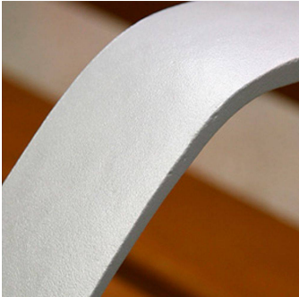
With cast aluminium feet.