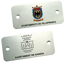
Aluminium plate 74 x 35 mm.