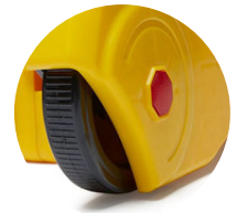
EASY ROLL WHEELS Quick and easy movement with the built-in castors