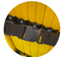
BUILT IN STRAPS Prevents the barrier from opening during transport