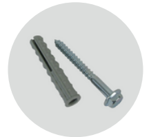
HEAVY-DUTY FIXINGS Ensures the bollard is safely fixed to the road.