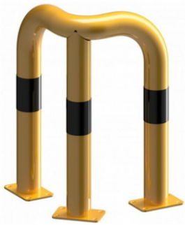
350 X 650MM