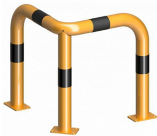
350 X 1150MM