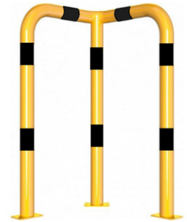
600 X 1150MM